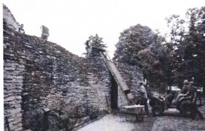
Volunteer church parishioners removing dirt