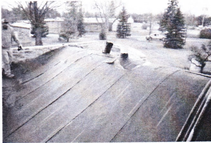
New waterproofing membrane