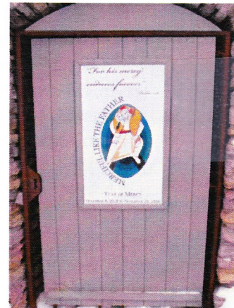
Our Lady of the Woods Shrine Holy Door in Mio