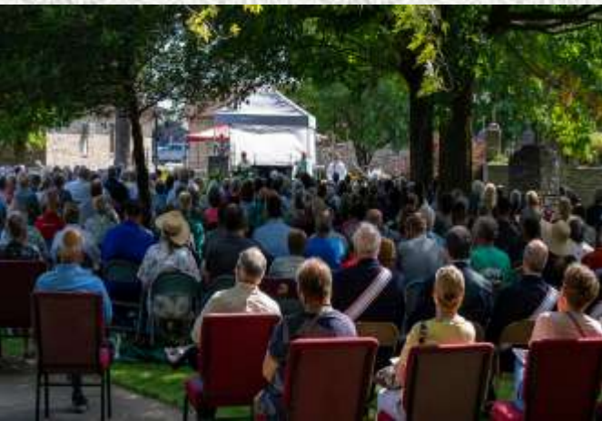
A very large crowd of 480 at Mass