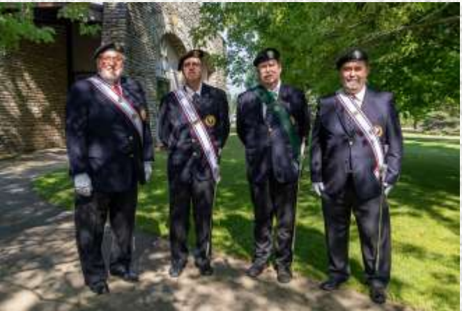
West Branch Color Guard—K of C