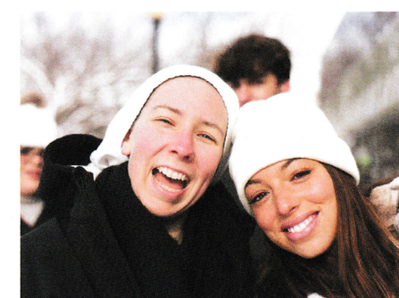
TOR Sisters accompanied students from FSU to the annual March for Life.

FSU is just one example of thriving campus ministries that have led to increased vocations. One of the best examples is the Diocese of Austin, whose four major universities each has its own